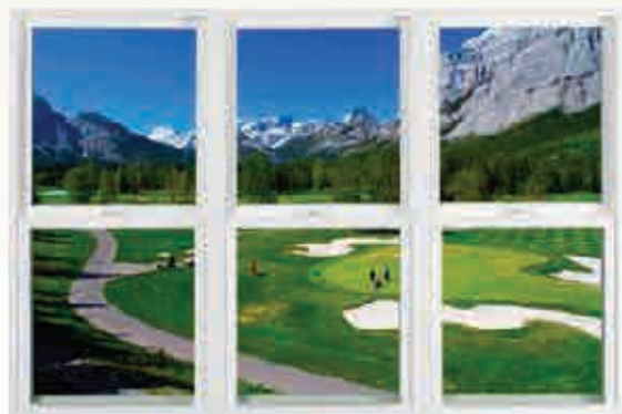
Common Frame Triple Double Hung