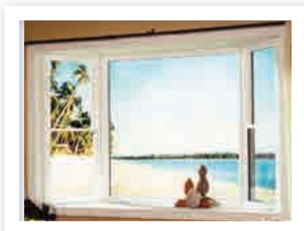
30° Bay Window