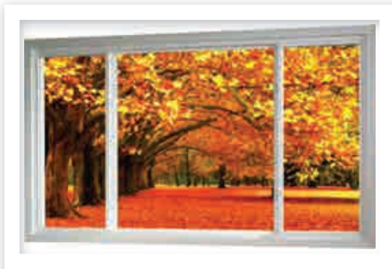
Three Lite Slider