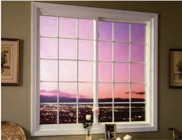
Two Lite Slider