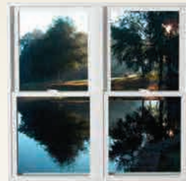
Common Frame Twin Double Hung