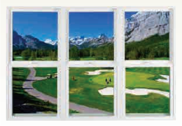
Common Frame Triple Double Hung