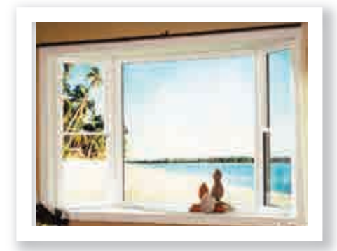
30º Bay Window