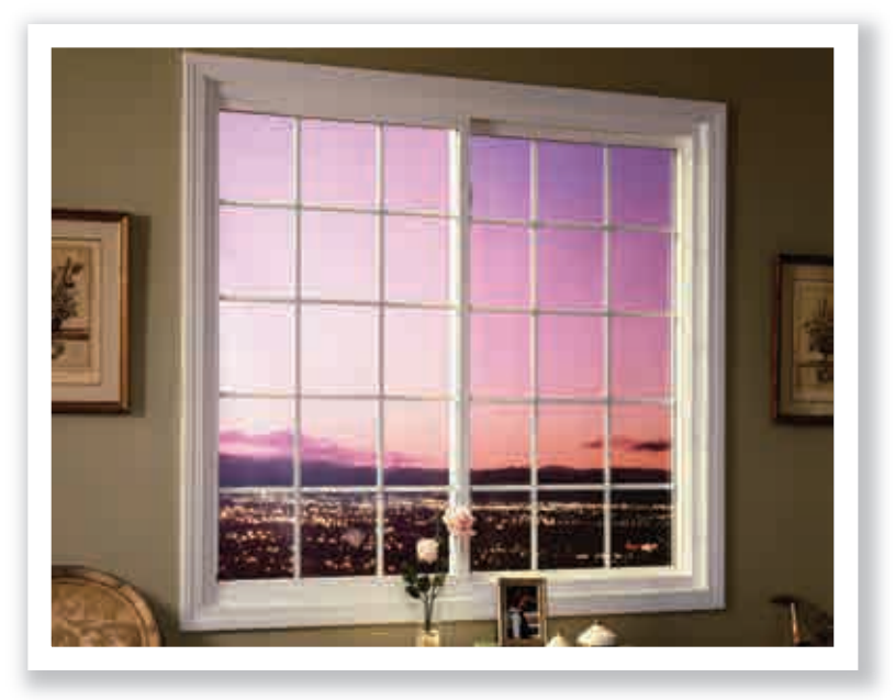
Two Lite Slider