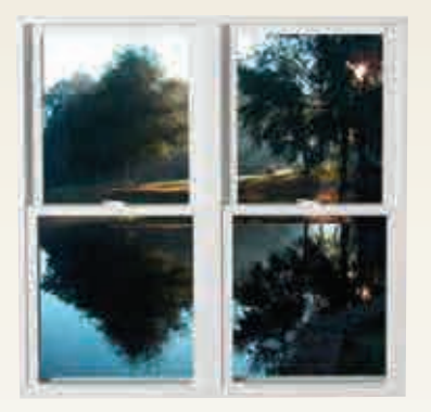
Common Frame Twin Double Hung